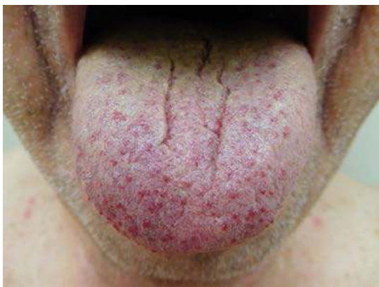
Figure 2 Telangiectases on the tongue of an 85-year-old man with hereditary hemorrhagic telangiectasia who suffered from occasional episodes of epistaxis.

favor sun-exposed areas. 1 Telangiectases blanch with pressure and color returns when pressure is released; this distinguishes them from petechiae and angiomas. 2 Lesions may bleed at times with little trauma, due to their proximity to the skin surface and also on account of their tortuous vessels. 2 Notably, telangiectases often increase in number as the patients age. 1