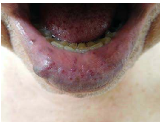
Figure 3 Vascular lesions on the lips of an 85-year-old man with hereditary hemorrhagic telangiectasia.

Pulmonary AVMs develop in 15%–50% of patients. The patients are usually asymptomatic. Lung AVMs cause right-to-left shunting, which cause an array of possible symptoms