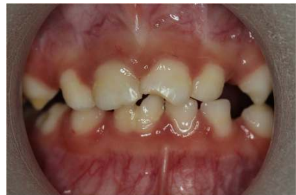
Fig. 3 Plaque accumulation and generalized mild to moderate gingival hyperplasia is evident. The incisal edge of her anterior incisor was chipped and there was fusion of her 81 and 82

Fluoride was applied on the second visit; an application of 5% sodium fluoride (Clinpro white) varnish using a small brush. The application of fluoride in accordance with the standard protocol of the institution, because of the high caries prevalence in the demographic area. This is usually attributed to poor oral hygiene practices and