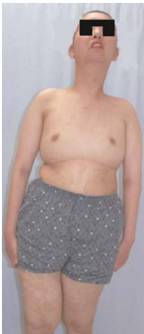
Fig. 1 Photographs of the patient. In addition to obesity of the trunk, thin limbs, and microcephalia, characteristic features of Cohen syndrome were observed, such as marked prominence of the nose root, wide nose wing, short philtrum, extorsion of thick lips, and large incisors. The coronal balance of the trunk was inclined.

On preoperative plain radiograph, scoliosis of T5-T11 was 47^{\circ} , that of T11-L3 was 79^{\circ} , L3 tilt was 34^{\circ} , and kyphosis of T7-L1 was 86^{\circ} (Fig. 2A,B). In the lateral bending film, both the