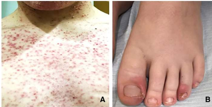
Figure 1. Skin toxicity associated with MEK inhibitors. (A): Acneiform rash in a postpubertal adolescent. (B): Paronychia in a child.