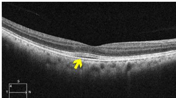
Figure 3. Ocular coherence tomography demonstrating a small retinal detachment and underlying fluid (arrow).

inhibitor use and may lead to permanent blindness. Fortunately, in adult MEK inhibitor trials, these serious retinal toxicities are reported in fewer than 1% of patients [46, 47].