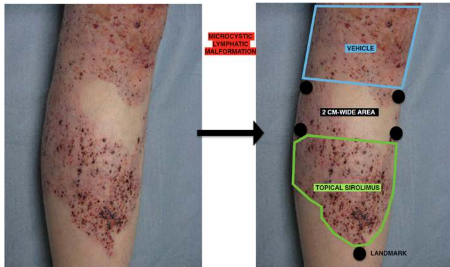
Fig. 1 Example of a CMLM of the leg: the investigator will define two areas of similar size and severity by using a ruler, with a separation area of at least 2 cm between both areas (5 points will be drawn on the patient to define the two areas to apply the product in a reproducible way by the nurse and to avoid inter-area contamination). CMLM cutaneous microcystic lymphatic malformation

patients’ adherence to the protocol. Indeed, due to the design, each patient will be his/her own control. Patients may observe an improvement in one of the two areas during the 12-week period and may therefore be attempted to apply the treatment allocated to this area to the whole CMLM, which would introduce group contamination. Therefore, we planned to have nurses apply the treatments; also, patients will be allowed to treat the whole CMLM area with the active drug at the end of the 12-week period. In doing so, we expect patients to be compliant with the protocol and not stop the study.