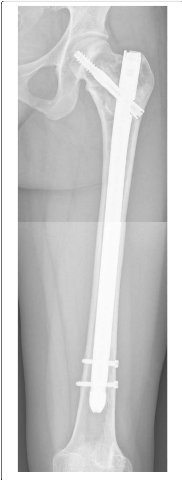
Fig. 3 Customized intramedullary nail. A customized intramedullary nail with a HA-coated proximal screw was used in one patient (ID 18), in order to ensure ingrowth in the femoral neck. The nail had an enlarged diameter because this particular patient had severe cortical thinning throughout the length of the femur, providing insufficient structural support for a standard sized intramedullary nail

cortex to be milled out to ensure submerging of the plate into the bone. In the MUG, removal of the hardware in patients with complaints of the iliotibial tract resulted in good functional outcome in all with no reported (new) pathological fractures. Notwithstanding these outcomes may have also be due to the fact that these cases had mild fibrous dysplasia and it is likely that the femur in more severe types of fibrous dysplasia may not be so forgiving after removal of any form of supporting hardware. Based on published literature and data from our combined cohort we can conclude that angled blade plates can be effectively and safely used in fibrous dysplasia of the proximal femur, providing that the lesion can be adequately bridged by the implant with proximal and distal locking of the angled blade plate into healthy bone. Based on the LUMC experience, we also recommend that the surgeon should ensure submerging of the plate into the bone, as this appears to prevent complaints of the iliotibial tract.