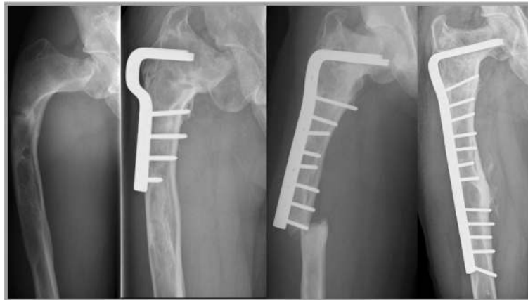
Fig. 1 Structural failure after angled blade plate endoprosthesis. The first patient that needed revision surgery (ID 7) was a male with shepherd's crook deformity of the femur and was previously treated elsewhere for a pathological femoral fracture by means of a valgus osteotomy combined with a short angled blade plate (Fig. 1). The coxa vara persisted however (FNSA 67^\circ ), associated with severe pain complaints for which he was referred to the LUMC, 8 years after his first surgery. A subtrochanteric osteotomy was performed and fixation was undertaken using a larger blade plate and a temporary external fixator, which resulted in improvement of the coxa vara (FNSA 97^\circ ) and good functional outcome. Pain was adequately controlled with additional bisphosphonate therapy. Four years later the patient unfortunately sustained a fracture of the femoral diaphysis, distal to the angled blade plate. This part of the femur was also affected with fibrous dysplasia and together with the stress riser of the distal angled blade plate formed a weak location in the femur, prone to fracturing. The angled blade plate was removed and a longer angled blade plate was inserted to cover the whole area of the affected femur. This procedure was followed by a good functional outcome and disappearance of pain symptoms lasting to the end of follow up

Historically, fibrous dysplasia lesions of the proximal femur were treated by curetting the lesion, with or