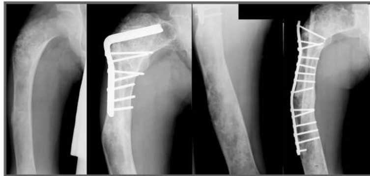
Fig. 2 The second patient who needed revision surgery (ID 12) was a male with a fracture through a fibrous dysplasia lesion of the proximal femur who was treated with a correction osteotomy and fixation with an angled blade plate in combination with an allogeneic strut graft at the age of fourteen (Fig. 2). He unfortunately sustained a stress fracture distal to the blade plate, 3 years after the initial surgery. The angled blade plate was removed during revision surgery and a long femoral plate was used to stabilize the femoral shaft. The patient was able to walk with crutches and had no more pain complaints. However, his severe coxa vara (FNSA 69°) remained unchanged