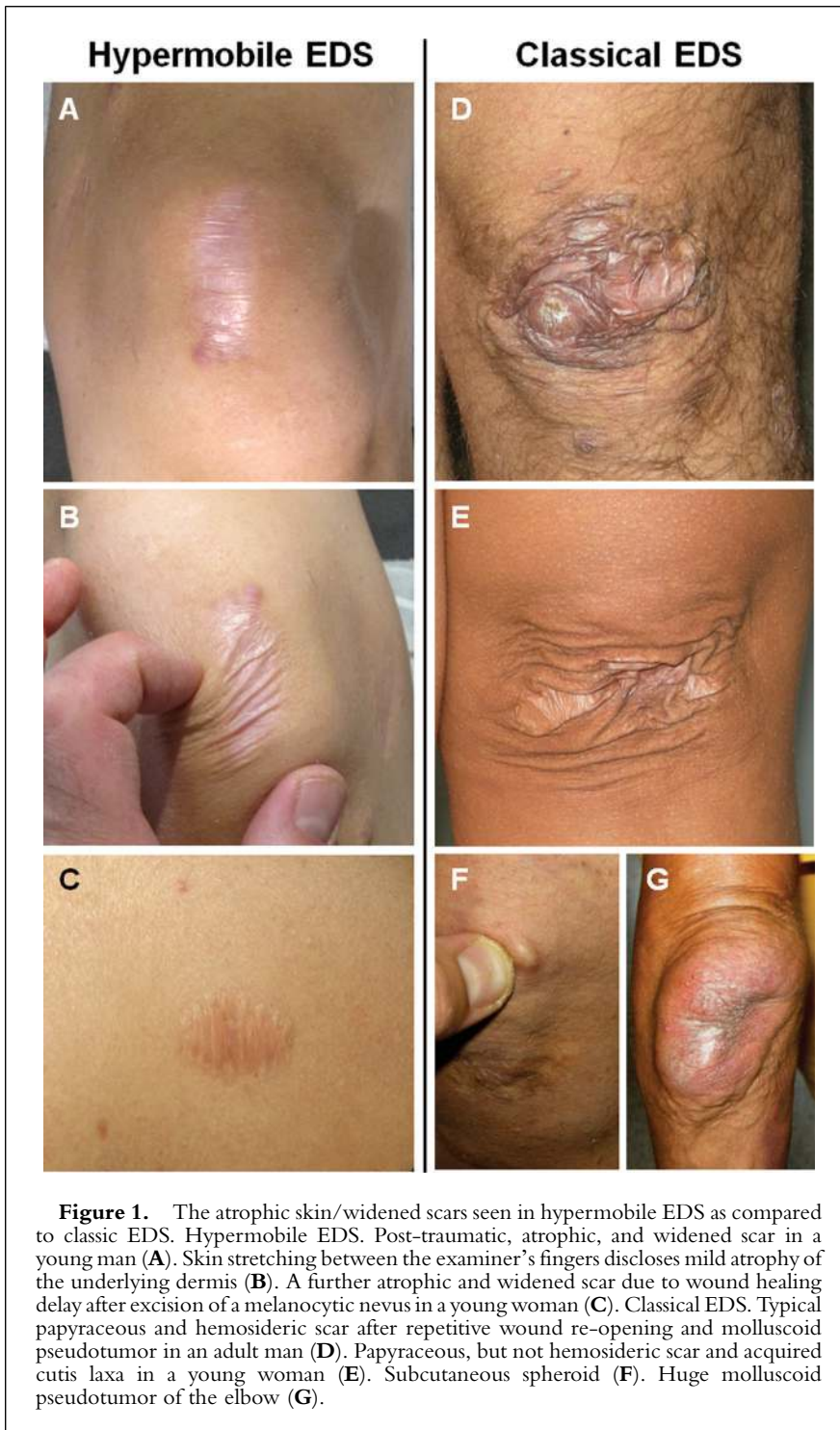
Figure 1. The atrophic skin/widened scars seen in hypermobile EDS as compared to classic EDS. Hypermobile EDS. Post-traumatic, atrophic, and widened scar in a young man (A). Skin stretching between the examiner's fingers discloses mild atrophy of the underlying dermis (B). A further atrophic and widened scar due to wound healing delay after excision of a melanocytic nevus in a young woman (C). Classical EDS. Typical papyraceous and hemosideric scar after repetitive wound re-opening and molluscoid pseudotumor in an adult man (D). Papyraceous, but not hemosideric scar and acquired cutis laxa in a young woman (E). Subcutaneous spheroid (F). Huge molluscoid pseudotumor of the elbow (G).

More than 90% of cEDS patients harbor a heterozygous mutation in one of the genes encoding type V collagen (COL5A1 and COL5A2).