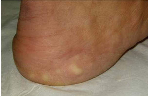
Figure 3. Piezogenic papules of the feet which are subcutaneous fat herniations through the fascia. They often appear as blanching white nodules only while bearing weight.