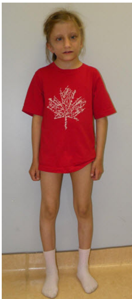
Figure 3. Frontal view of the girl in Figure 1. She has proportionate short stature with height <3rd centile.

A multigene panel that includes SRCAP and other genes of interest (see Differential Diagnosis) is most likely to identify the genetic cause of the condition at the most reasonable cost while limiting identification of variants of uncertain significance and pathogenic variants in genes that do not explain the underlying phenotype. Note: (1) The genes included in the panel and the diagnostic sensitivity of the testing used for each gene vary by laboratory and are likely to change over time. (2) Some multigene panels may include genes not associated with the condition discussed in this GeneReview . (3) In some laboratories, panel options may include a custom laboratory-designed panel and/or custom phenotype-focused exome analysis that includes genes specified by the clinician. (4) Methods used in a panel may include sequence analysis, deletion/duplication analysis, and/or other non-sequencing-based tests.