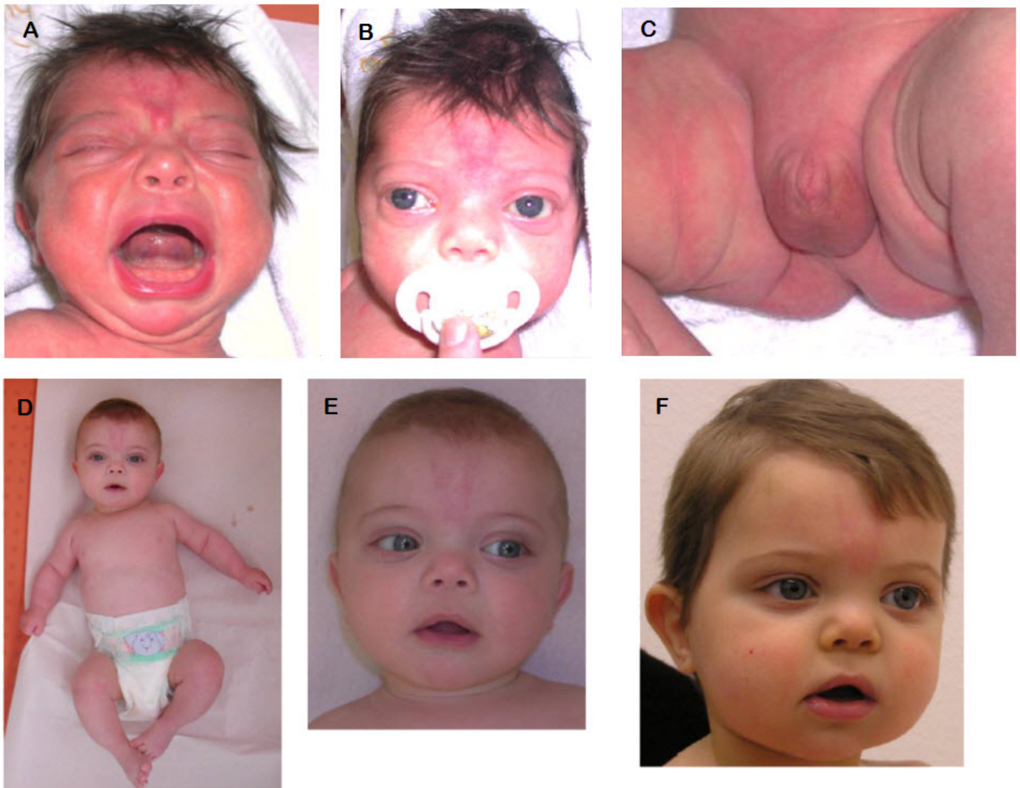
Figure 2. A boy with WNT5A -associated autosomal dominant Robinow syndrome at different ages. Note the widely spaced and prominent eyes, high anterior hairline, frontal bossing, depressed nasal bridge, short nose with anteverted nares, wide nasal bridge with a broad nasal tip, long philtrum, low-set ears (A, B, D, E, F), genital hypoplasia (C) and limb shortening predominantly affecting the upper limbs (D).