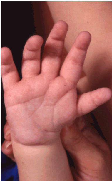
Figure 3. Hand Typical CHARGE hand: square hand, short fingers, finger-like thumb, hockey-stick palmar crease