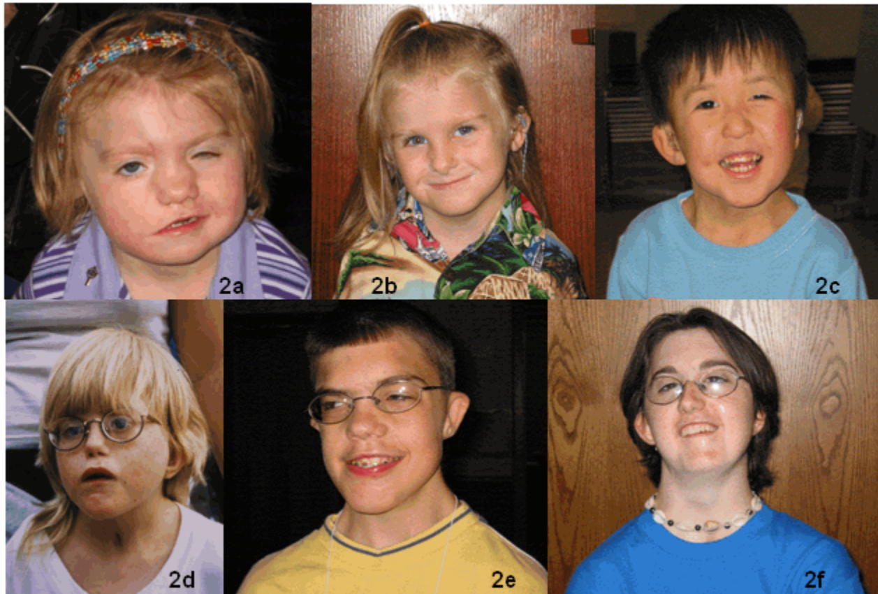
Figure 2. Face

2a. Female age 2.5 years; square face, round eye, straight nose with broad nasal root, unilateral facial palsy